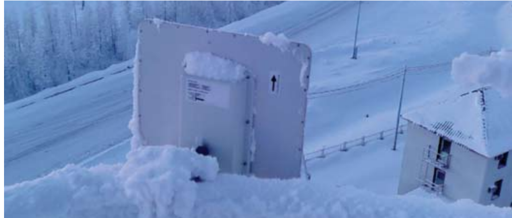
RADWIN's WinLink 1000 in Russia at -50 degrees celsius